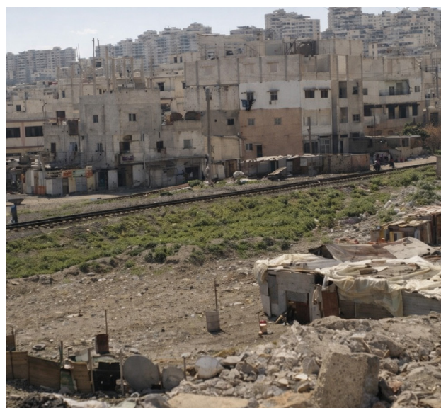
Figure 2. Informal housing in Latakia.

been destroyed or severely damaged (UN-Habitat, 2022). Around 35% of urban schools and over half of hospitals are not operational. Around 760,000 urban housing units have been damaged or destroyed, making access to adequate housing in Syria a hard to reach target. Moreover, the 2021 Humanitarian Needs Assessment estimates that 5.88 million people are in need of shelter due to the loss of capital and destruction of housing infrastructure. According to the same report, 31% of the population live in inadequate housing conditions, 50% of returnees live in damaged buildings and 26% of IDPs