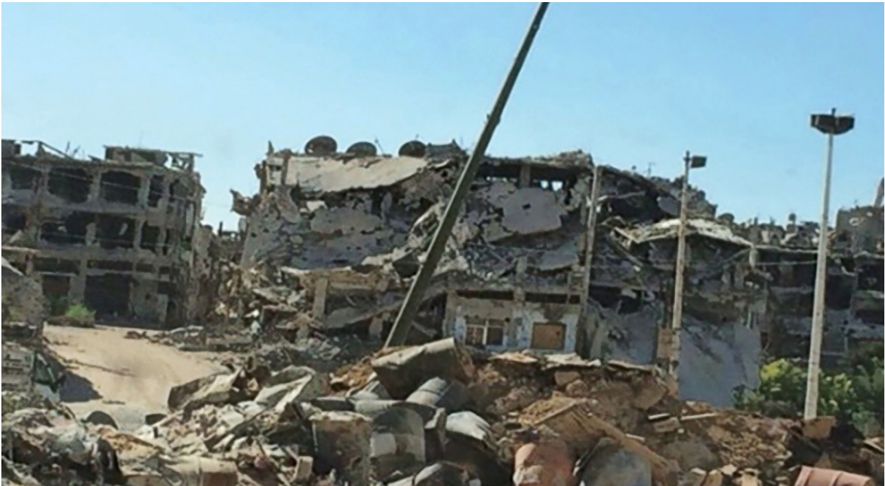
Figure 3. Destruction of urban infrastructure, Homs, Syria, 2013.

live in damaged/unfinished buildings or public and non-residential buildings.