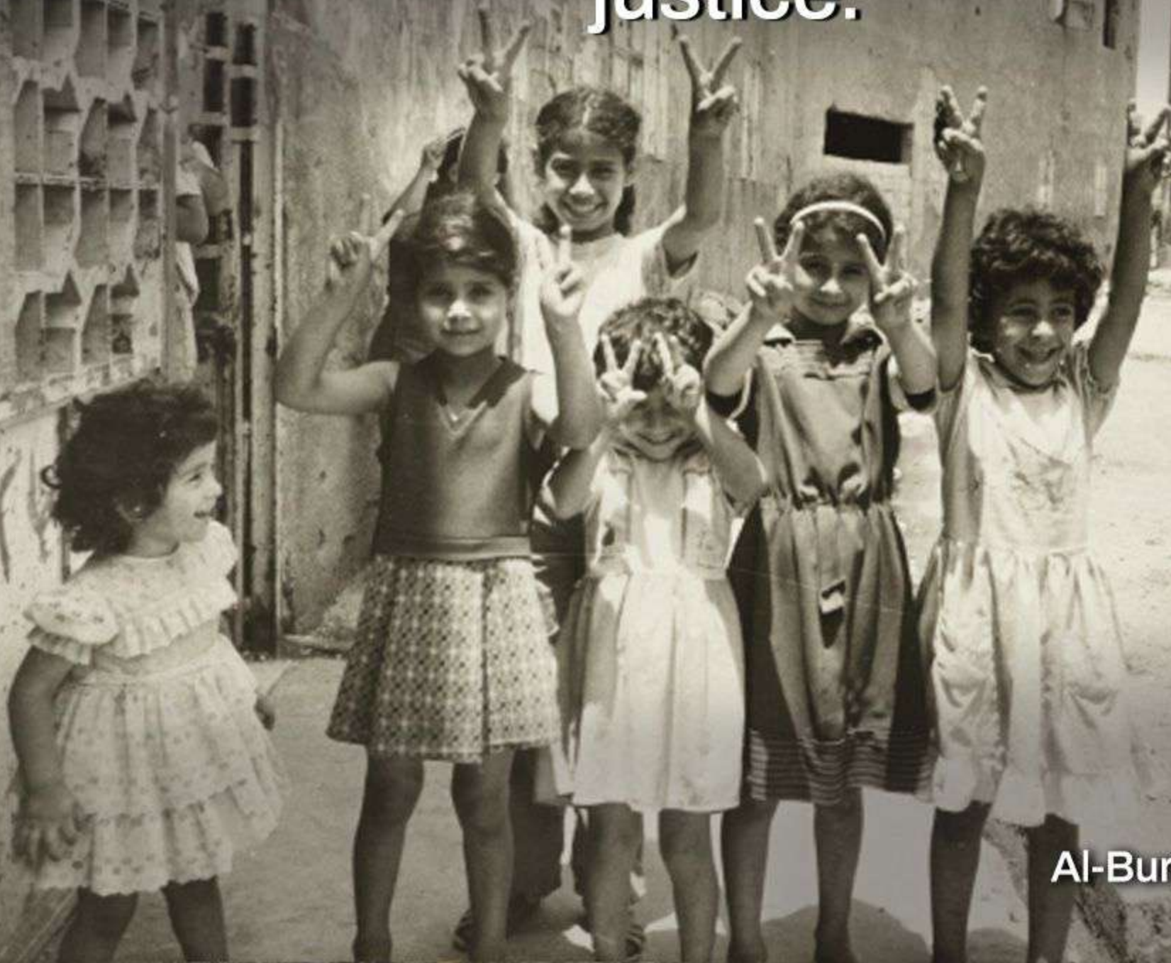
Al-Burj Refugee Camp 1980s

Join in the fight for truth, dignity and justice.